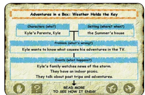
Interactive concept maps help students organize story elements.