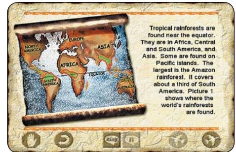
Students read passages in a variety of formats including fiction, expository, persuasive, argumentative, and informational texts.

In the Posttest phase, the program: • Assesses students' progress.