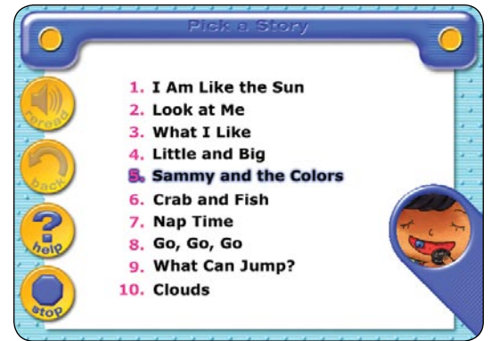
Students choose a story to read from the teacher assigned list.