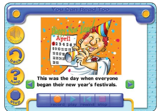
Students read and record the story to improve fluency.

Each level includes eleven correlated speaking, reading, and writing activities: